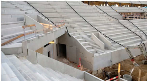
Stand elements and stairs for the new home of the soccer club Rapid