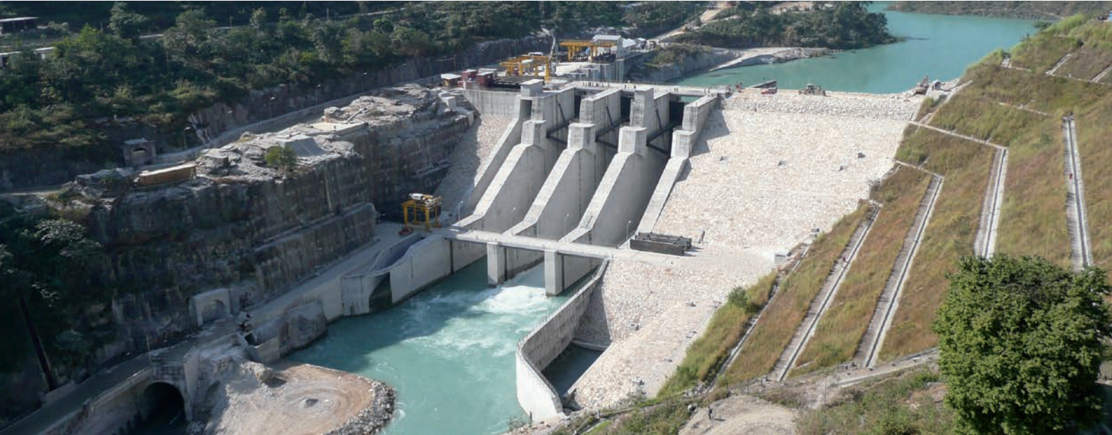
Project: Hydroelectric Power Plant Middle Marsyangdi, Nepal, Constructor DYWIDAG International GmbH

Allplan Terrain is directed at architects, city planners and landscape architects as well as civil engineers. In combination with Allplan Architecture or Allplan Engineering, building construction and civil engineering works can be efficiently planned while taking into account the real terrain, the urban development environment and the surrounding road network.