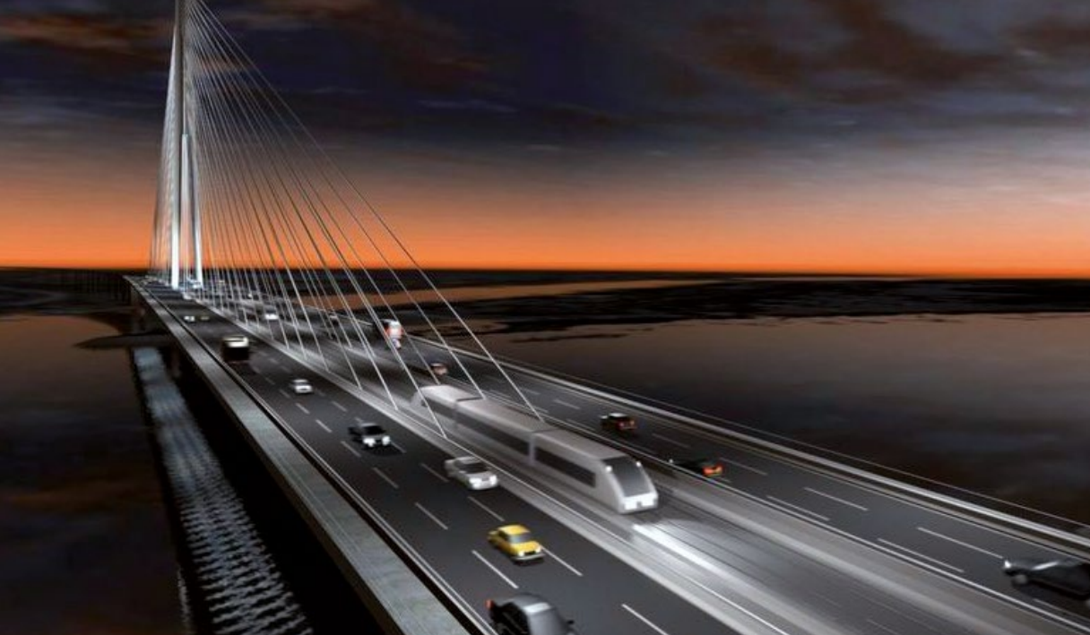
The 200-meter-high pylon will attract attention as a visible landmark of the city.

By contrast, the planners achieved the even distribution of the weight over the 250 meter long retention area by using a prestressed concrete construction, which will be created using what is referred to as the incremental launching technique. This involves individual bridge sections, referred to as the "increments", being produced in a fixed-location formwork. Once a section is ready, it is pushed over the columns, together with the sections which have been produced previously, and the next increment unit is cast in the same formwork mould. The side section, which is 358 meters long, will also be erected using this technique. Starting from axis 1, it will be pushed piece by piece in the direction of the centre of the bridge.