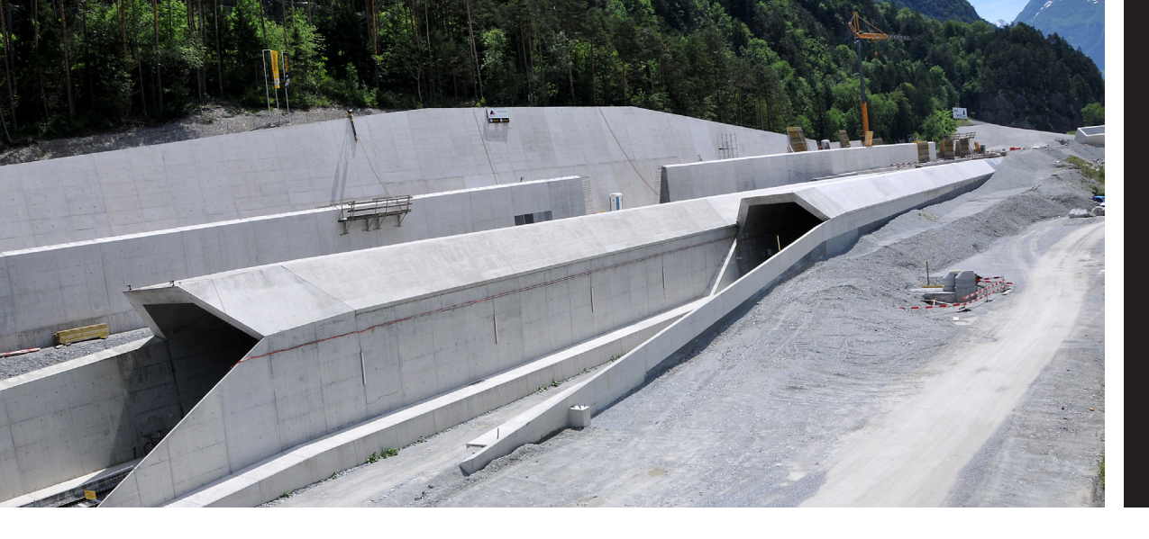
Gotthard Base Tunnel northern side portals near Erstfeld

centerpiece of the Amsteg section, which is roughly 11 kilometers long. Before the tunneling towards Sedrun could begin, a 1.8-kilometerlong access adit had to be built. Then came the excavation of a "base point" with rail technology caverns, construction adits and intersections. A tunnel boring machine with a diameter of 3.7 meters drilled a 1.8-kilometer-long cable adit to connect to the underground center of the Amsteg power station for subsequent traction supply. During blasting, the first 400 meters of each tunnel tube and the assembly caverns for setting up the tunnel boring machines were excavated. Both tunnel boring machines started driving at full capacity towards Sedrun at threemonth intervals. After crossing a predicted fault zone without any problems in the western tube, tunneling came to a surprising standstill when a water ingress washed loose material into the drill head and caused a blockage. To free the tunnel boring machine, it was driven backwards out of the eastern tube, and the entire loosened zone was strengthened with massive injections. Tunneling could resume again after a standstill of around six months. Thanks to an average daily output of 11.05 meters, the holing-through of both tubes to the Sedrun section was celebrated several months ahead of schedule, despite the standstill.