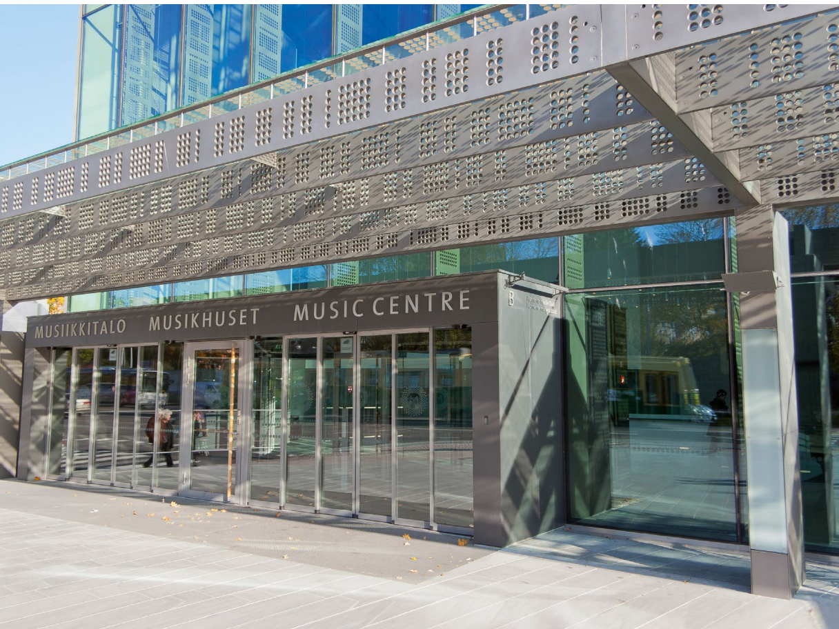
Helsinki Music Centre, Helsinki, Finland