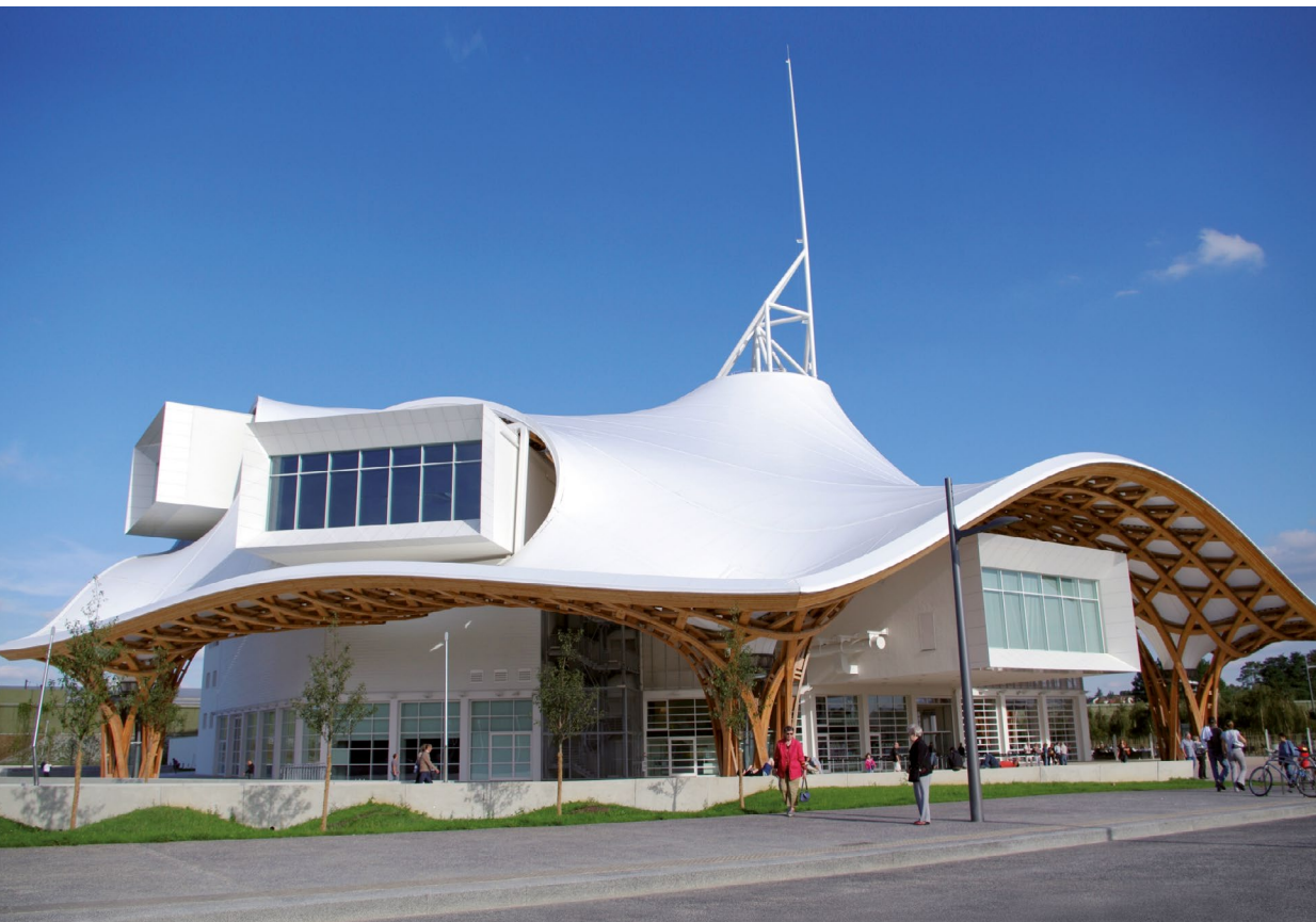
Centre Pompidou-Metz, Metz, France