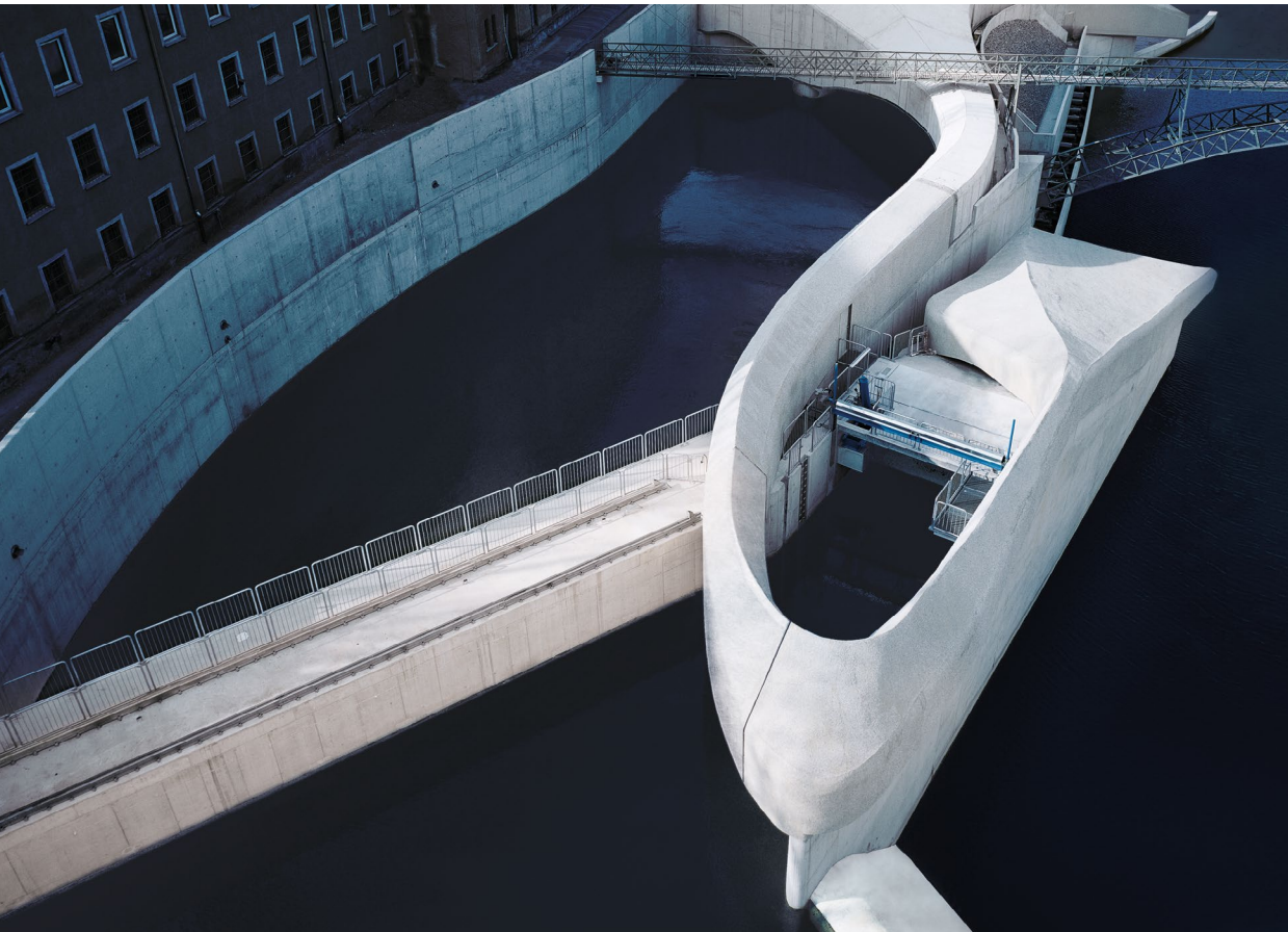
Keselstraße hydroelectric power station, Kempten