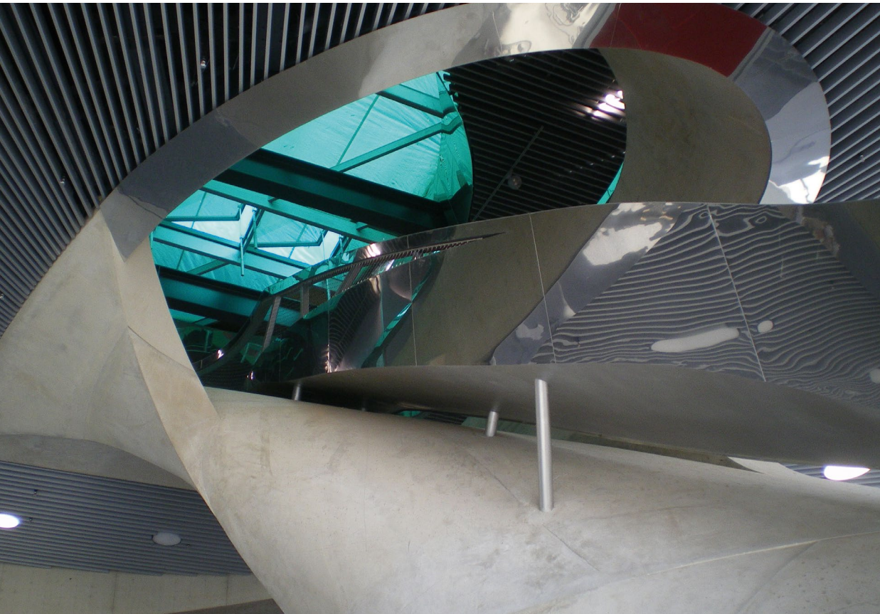
Musiktheater Graz, Austria