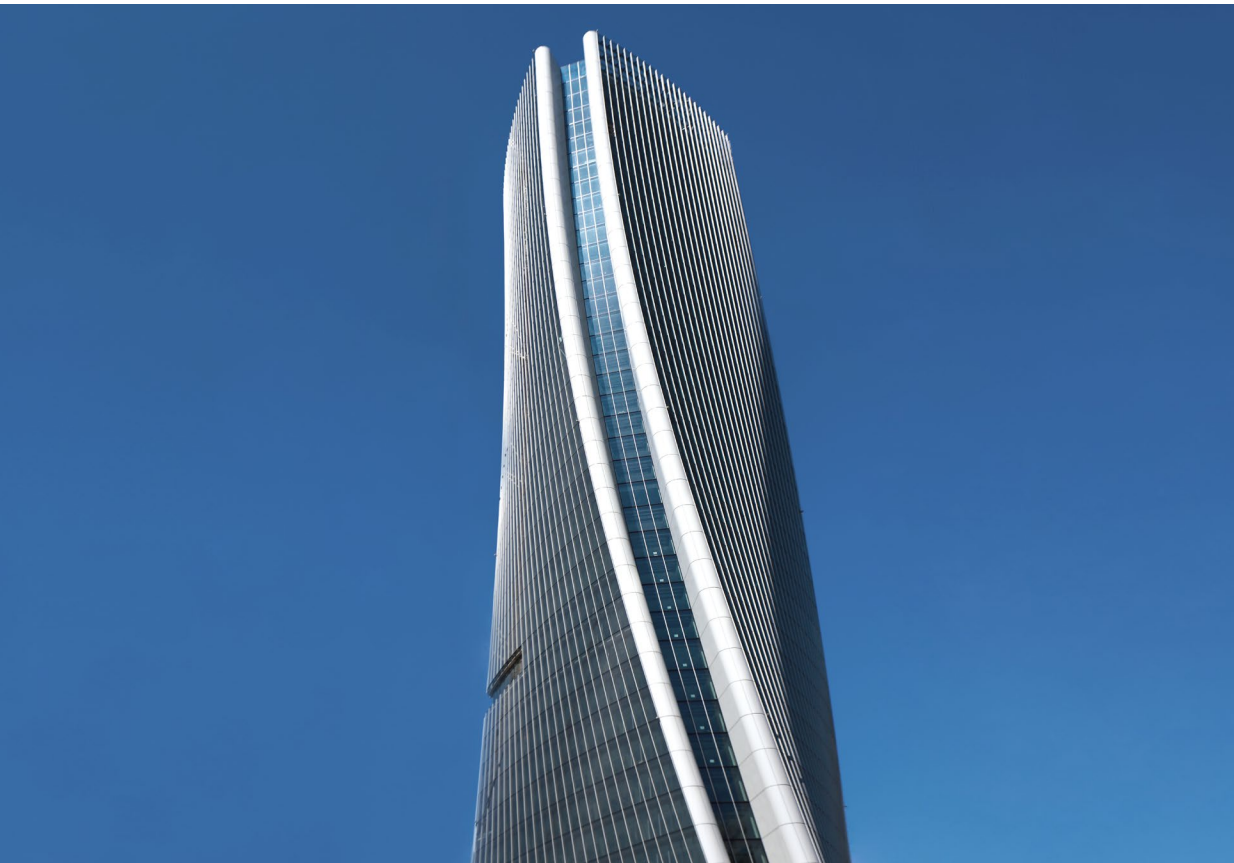
Zaha Hadid Tower in the CityLife district, Milan (Italy), Redesco Progetti S.r.l.