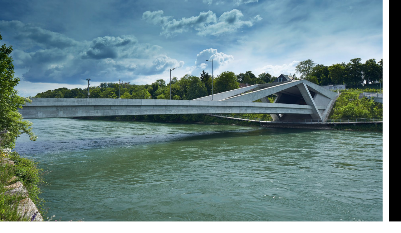
The Aarebridge is a combination of bridge and tunnel portal with sophisticated statics and geometry

For bridge construction engineer Rudolf Vogt, one thing is clear: "The reinforcement and pre-tensioning plans for this level of complexity in the structure could only be tested in the 3D model." It is only thanks to the spatial representation that its possible to see into the relevant part of the structure in order to detect missing reinforcements or incorrect joint lengths, for example. But it is not just Rudolf