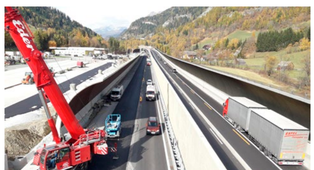
Image left and bottom right: Construction on the Tauern highway in Eben (Austria). © Leube Betonteile GmbH & Co KG

Image top right: Detail view of the Great Arch. © Leube Betonteile GmbH & Co KG