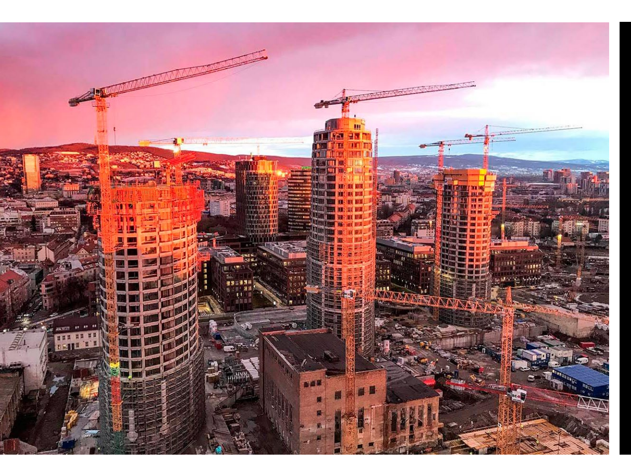
© Sky Park Residence, Bratislava – Photo of the construction @ Penta Real Estate s.r.o.